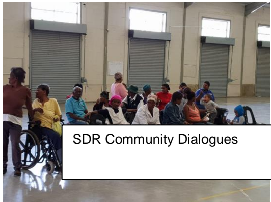
SDR Community Dialogues