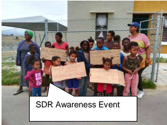
SDR Awareness Event