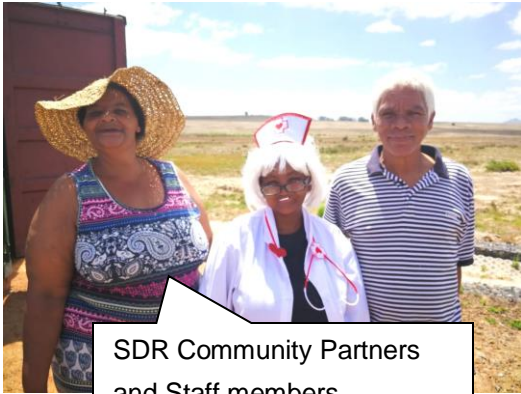
SDR Community Partners and Staff members