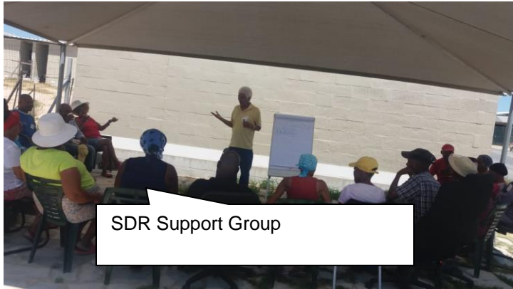
SDR Support Group