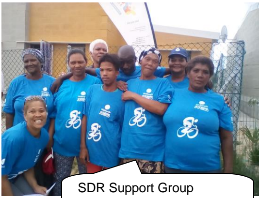
SDR Support Group Members graduating