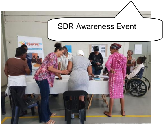
SDR Awareness Event