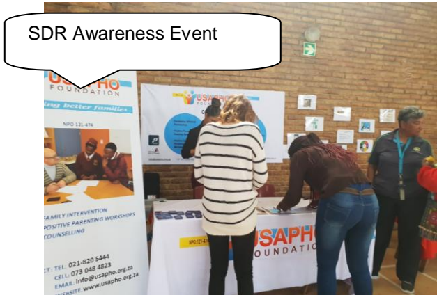
SDR Awareness Event