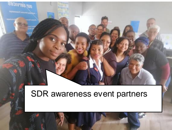
SDR awareness event partners